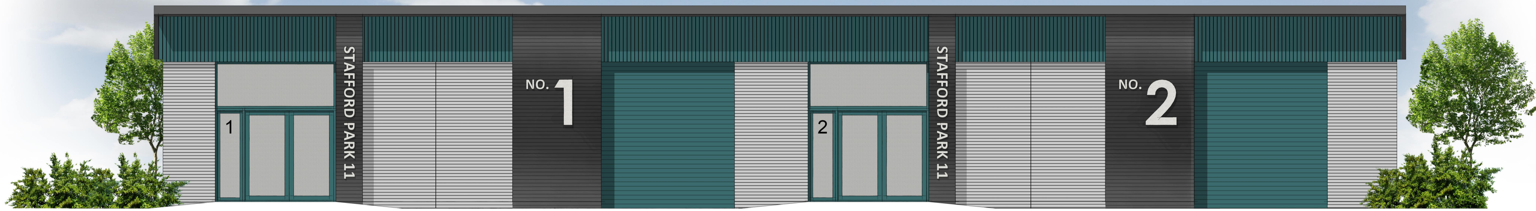
PROPOSED SOUTH ELEVATION (FRONT)