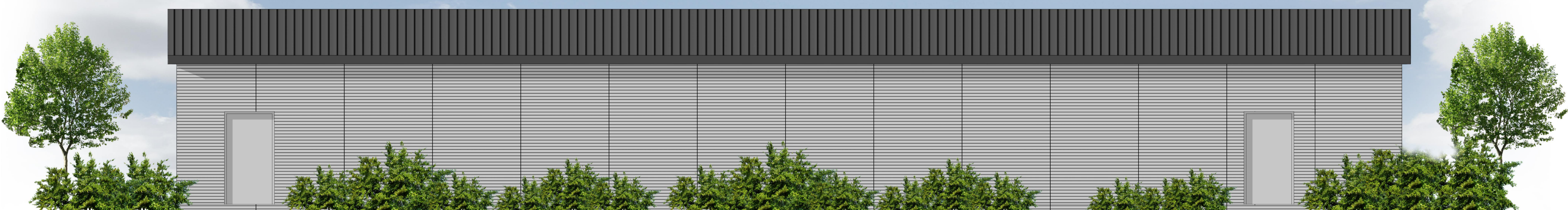
PROPOSED NORTH ELEVATION (REAR)